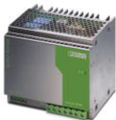
DIN rail power supply unit 24 V DC/20 A, primary switched-mode, 1-phase.

Please be informed that the data shown in this PDF Document is generated from our Online Catalog. Please find the complete data in the user's documentation. Our General Terms of Use for Downloads are valid ( http://phoenixcontact.com/download )