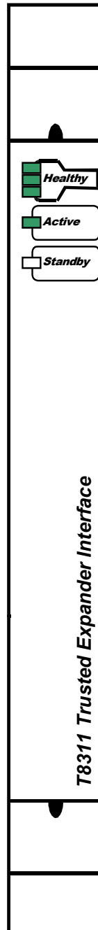
Figure 3 Module Front Panel