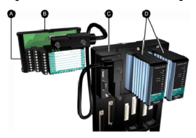
Figure 1 - FBM216b Redundant Module Configuration

The FBM216b has a rugged extruded aluminum exterior for physical protection of the circuits. Enclosures specially designed for mounting the FBMs provide various levels of environmental protection.